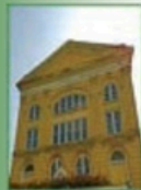
Jackson Street United Methodist Church

Each participating church will open 15 minutes before their concert and will remain open for 1 hour.