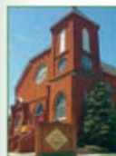
Diamond Hill Baptist Church

For more information, call the office at 434.846.6098 www.interfaithoutreach.org or follow us on Facebook and Instagram.