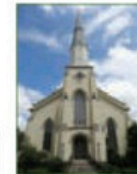
Holy Cross Catholic Church