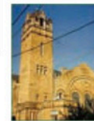
Court Street United Methodist Church