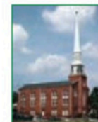
Court Street Baptist Church