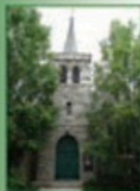
First Unitarian Church